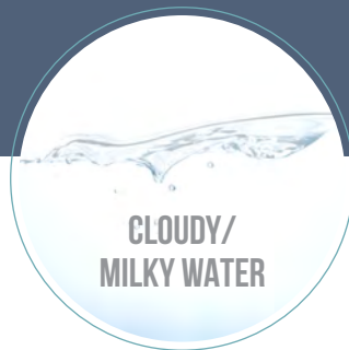
CLOUDY/ MILKY WATER

Tiny air bubbles in the water, similar to gas bubbles in beer and soda.