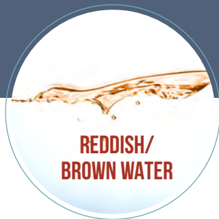
REDDISH/ BROWN WATER

The following information describes common causes for possible changes in your water: