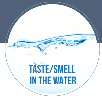
TASTE/SMELL IN THE WATER

Particles and sediment resulting from changes or activities in the water distribution system such as the flushing of water.